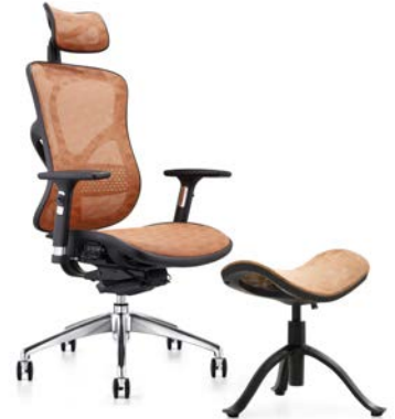
F-OTTOMAN FOOT STOOL