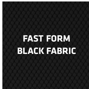
FAST FORM BLACK FABRIC

Our FAST FORM next-day delivery chairs are available in full S-mesh or S-mesh back with black fabric seat.